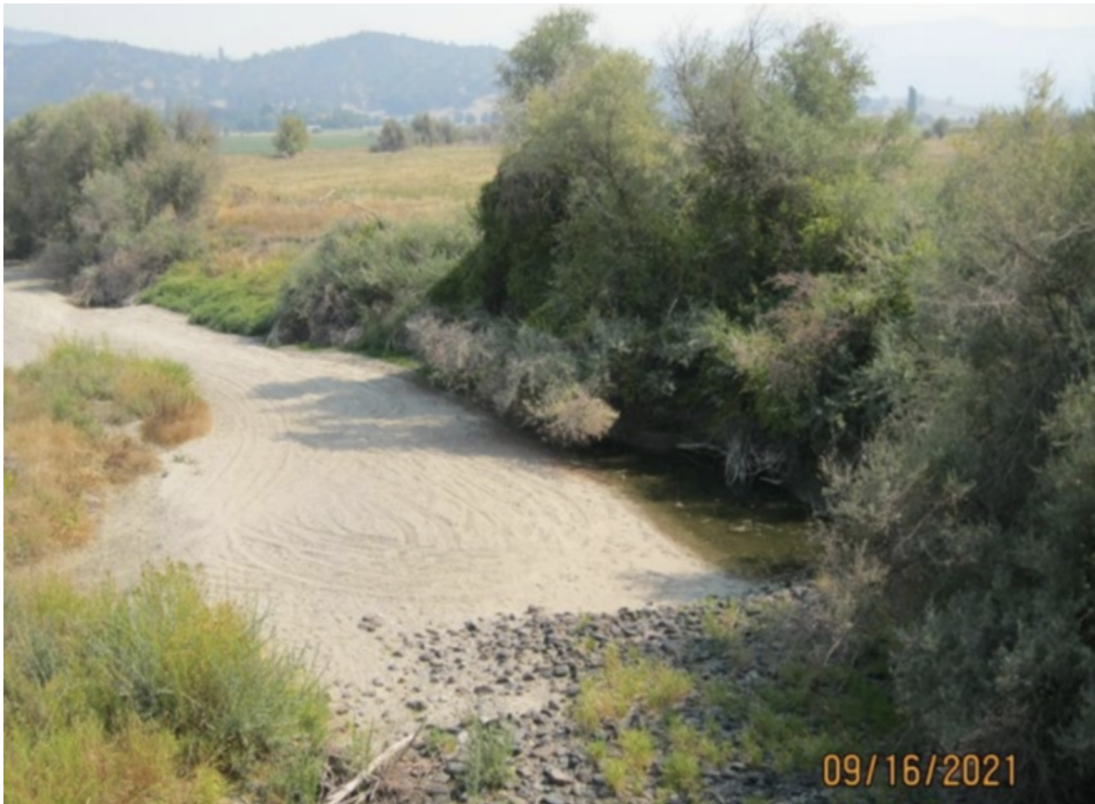
Nearly Dry California Scott River Tributary to Klamath River

34. Chronology of Sediment Deposition in Upper Klamath.pdf