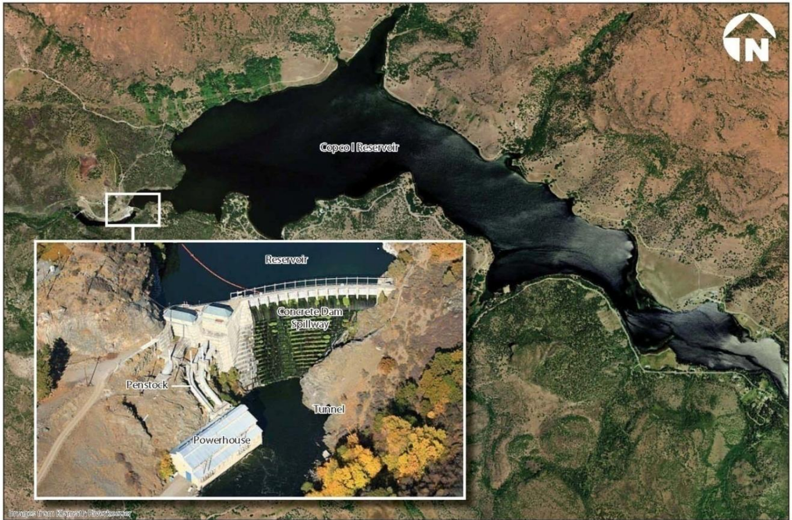
Above: Copco 1 Dam, Powerhouse, and Reservoir. Figure ES-4 of page ES-15 from KlamathFacilitiesRemoval_EISEIR_09222011.pdf , File #18.